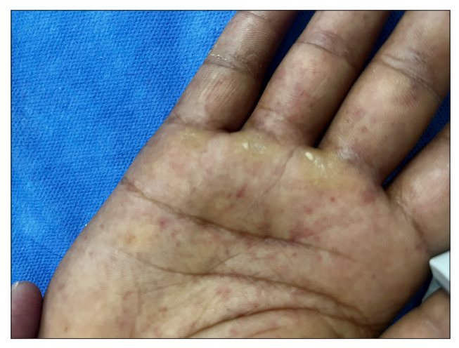
Figure 2: Janeway lesions on the palms.

reported taking amoxicillin-clavulanate for 2 days before arrival, which may have influenced culture results. In view of elevated ferritin levels and triglyceride levels, splenomegaly and with a normal coagulation profile, HLH was suspected. Bone marrow aspiration histology showed evidence of hemophagocytes, confirming the diagnosis of HLH [Figure 3] as per HLH-2004 criteria. Transthoracic echocardiography (TTE) revealed moderate mitral regurgitation, however, had no vegetation in any of the valves; however, the absence of vegetation does not rule out the diagnosis of IE. Chest imaging indicated bilateral pulmonary edema secondary to acute mitral regurgitation (MR). Although blood and urine cultures were sterile, bone marrow culture confirmed the presence of N. meningitidis [Figure 4]. Intravenous immunoglobulin (IVIG) at dosing 2 grams/kilogram body weight divided into 5 days was started along with dexamethasone and was continued on culture-sensitive