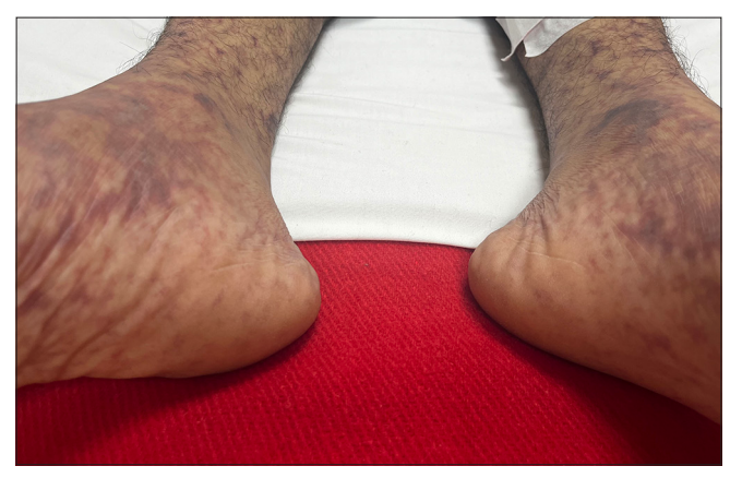
Figure 1: Non-blanchable petechial rash on the lower limbs.

Laboratory parameters showed anemia, polymorphic leukocytosis, thrombocytopenia, elevated alanine aminotransferase and aspartate transaminase (> 3\times upper limit of normal), hyperferritinemia (2,100 ng/mL), and high prolactin and hypertriglyceridemia (345 mg/dL). A bacterial septicemia diagnosis was made and was started on broadspectrum antibiotics (ceftriaxone, vancomycin, doxycycline) along with oxygen support. Blood and urine cultures were collected before initiating antibiotics; however, the patient