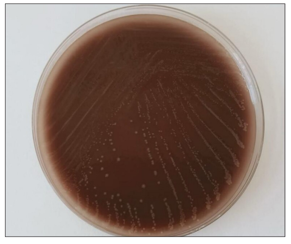
Figure 4: Bone marrow culture showed growth of Neisseria meningitidis on chocolate agar medium.